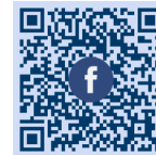
Parent to Parent Facebook Page