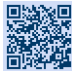
Parent to Parent

Open your camera app to link to websites