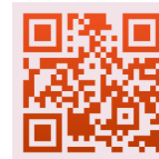
Island County Autism Resource

Call/Text (360)632-7539 https://www.islandcountywa.gov/198/Parent-to-Parent